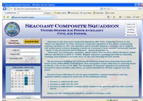
SQUADRON WEBSITE OVERHAUL! Find out more on page 3

Want to make a submission? Contact the editor: jsmith@enterasys.com